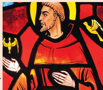
ST. FRANCIS OF ASSISI October 4

Traditionally, a blessing of animals happens together with the feast of St. Francis of Assisi. Our Blessing of Animals is scheduled for Tuesday, October 4 at 6:30 PM under the Church Portico . In past years we have had household pets as well as farm animals—please feel free to bring any of God's creatures, great or small, for this blessing.